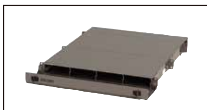
AX104681, FX UHD Patch Panel 1U with mounted Splice Housing Kit (AX104684)