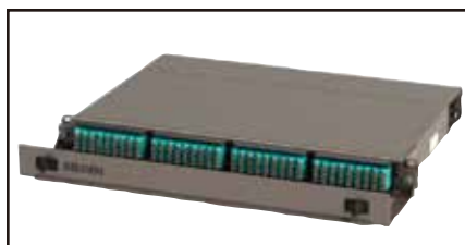
AX104681, FX Ultra HD 1U Patch Panel Housing (shown loaded)