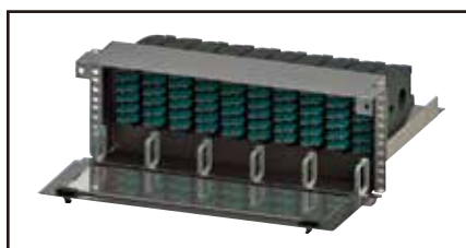
AX105167, FX UHD 4U Patch Panel Recessed Shelf (shown loaded)

Elegantly simple yet uncompromisingly flexible. Ultra high-density rack-mount fiber connectivity system, crafted for effortless installation and maintenance.