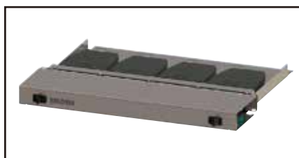
AX105164, FX UHD 1U Patch Panel Standard Shelf (shown loaded)